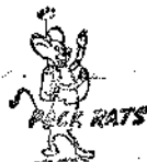
MT. AIRY VHF RADIO CLUB, INC.