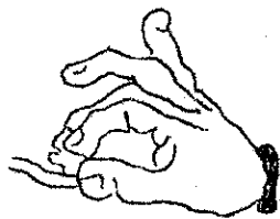
THE TEA DRINKER